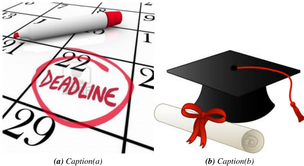
Figure 3.3 Example of 2-figures Subfloating - All figures position is center and top by default - to change the figure position please use position command after beginfigure - Click Here to see further

The “how to” component of the proposal is called the Research Methods, or Methodology, component. It should be detailed enough to let the reader decide whether the methods you intend to use are adequate for the research at hand. It should go beyond the mere listing of research tasks, by asserting why you assume that the methods or methodologies you have chosen represent the best available approaches for your project. This means that you should include a discussion of possible alternatives and credible explanations of why your approach is the most valid. Fig 3.1 shows the example of single figure, fig 3.2 shows the example of 3-figures Subfloating and fig 3.3 shows the example of 2-figures Subfloating.