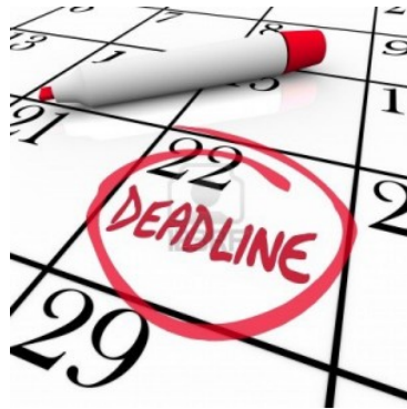
Figure 3.1 Example of single figure - All figures position is center and top by default - to change the figure position please use position command after beginfigure - Click Here to see further

The chapter Research Objectives and Approach clarifies the research objectives of your project, taking as its background your description of the state of the art, and describes the methodological approaches you have in mind to face the key research challenges of your project. The clarification of the research objectives should build solidly on the State of the Art and relate your research to the work carried out by others. It should elucidate the measure to which your work develops from their work and the extent to which it diverges from theirs to open up new and yet unexplored avenues. In essence, the chapter Research Objectives and Approach explains what you plan to do to tackle your research problem, why you plan to do it that way, and how you are going to do it.