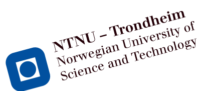
Figure 2.1: This is the logo of NTNU (rotated 15 degrees).